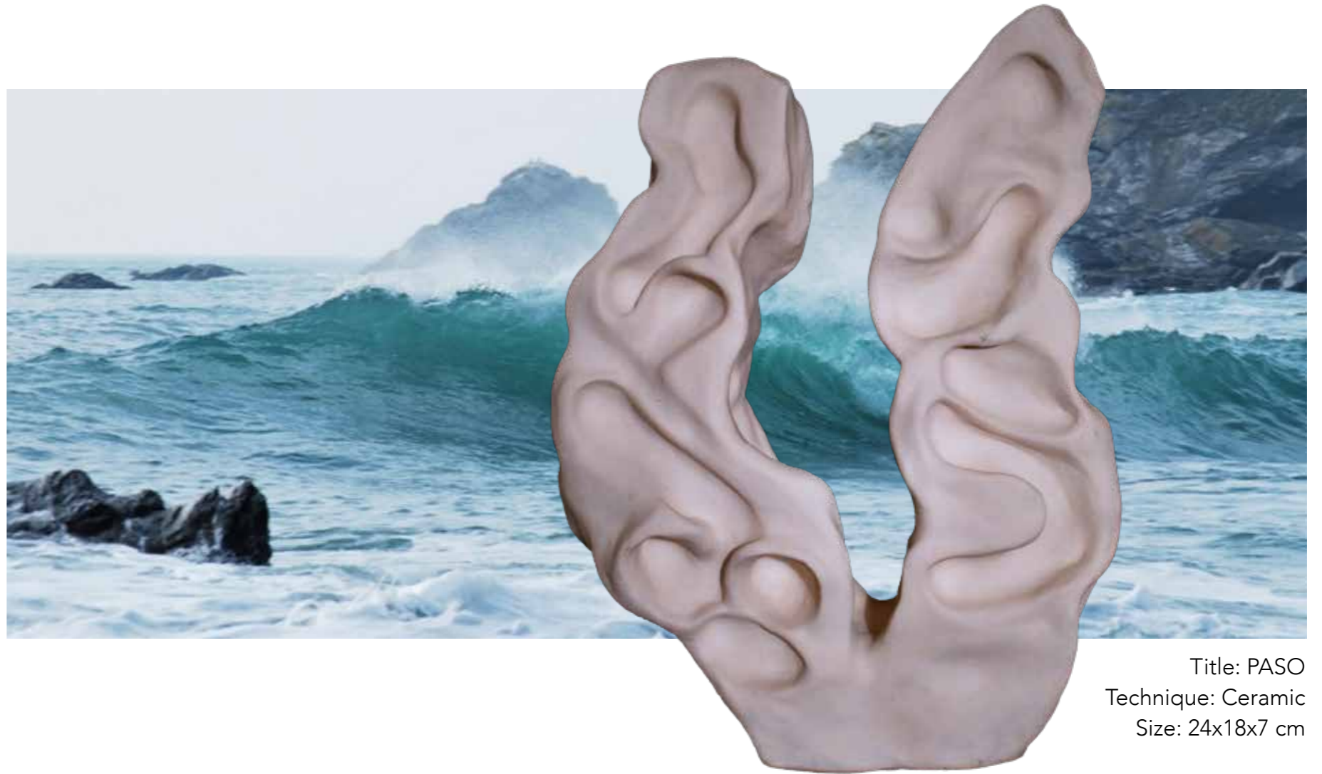
Title: PASO Technique: Ceramic Size: 24x18x7 cm