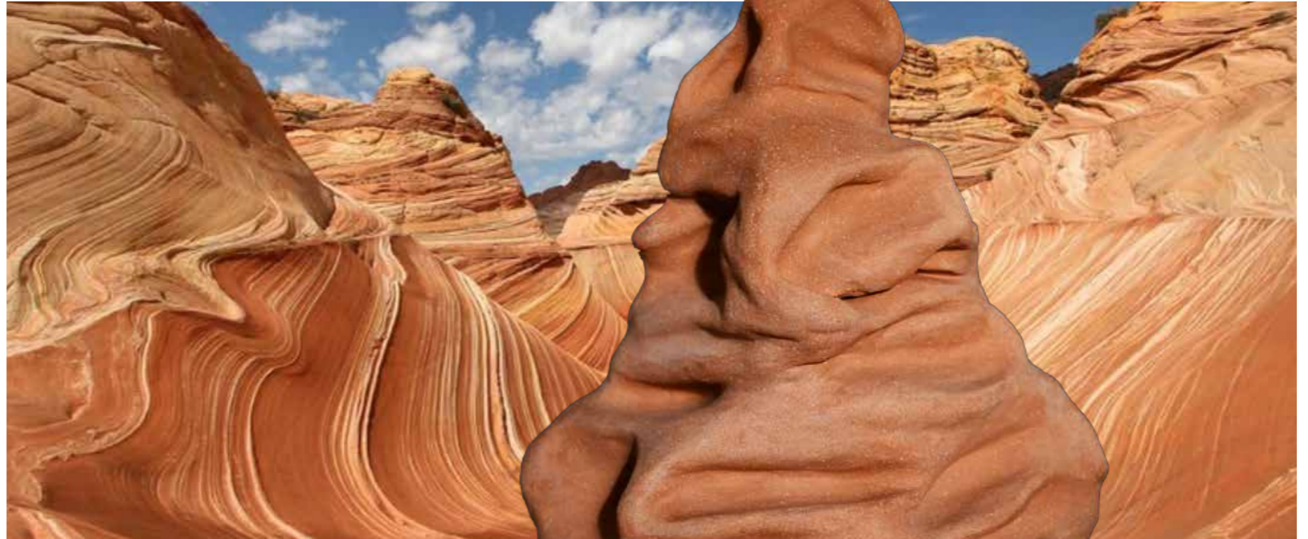
Title: KARST Technique: Ceramic Size: 16,5x11x9 cm