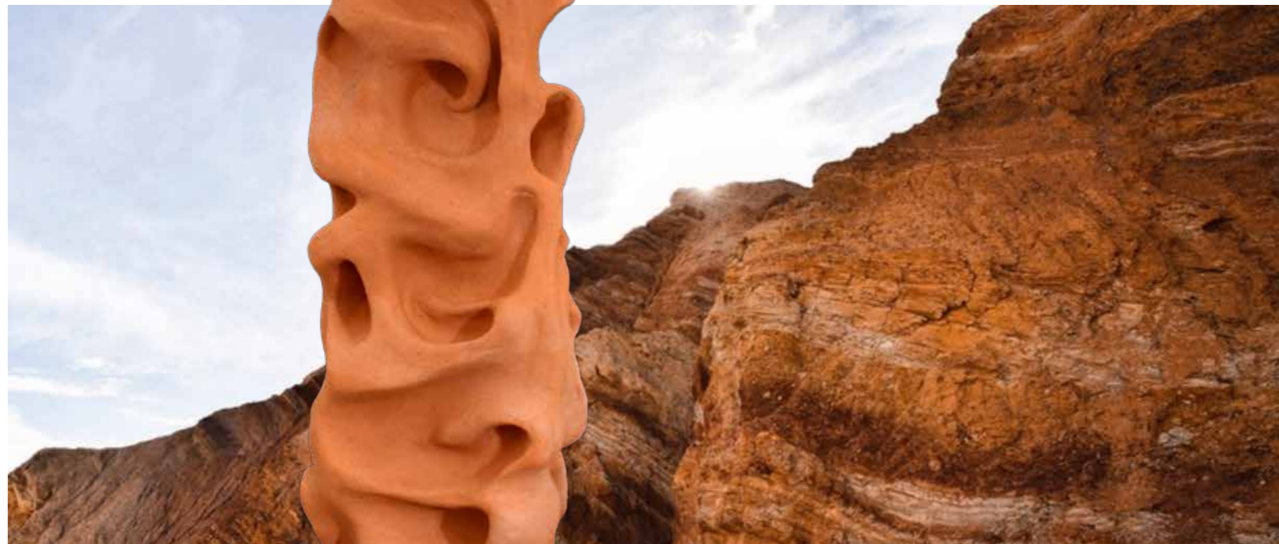
Title: LAHAR Technique: Ceramic Size: 33x11x10 cm