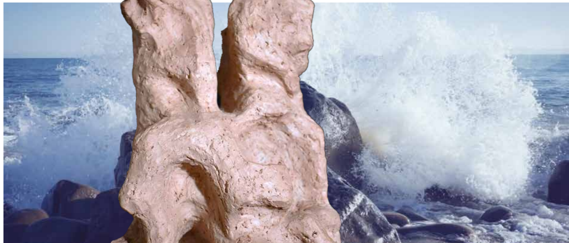
Title: FARALLON Technique: Ceramic Size: 21x17x4 cm