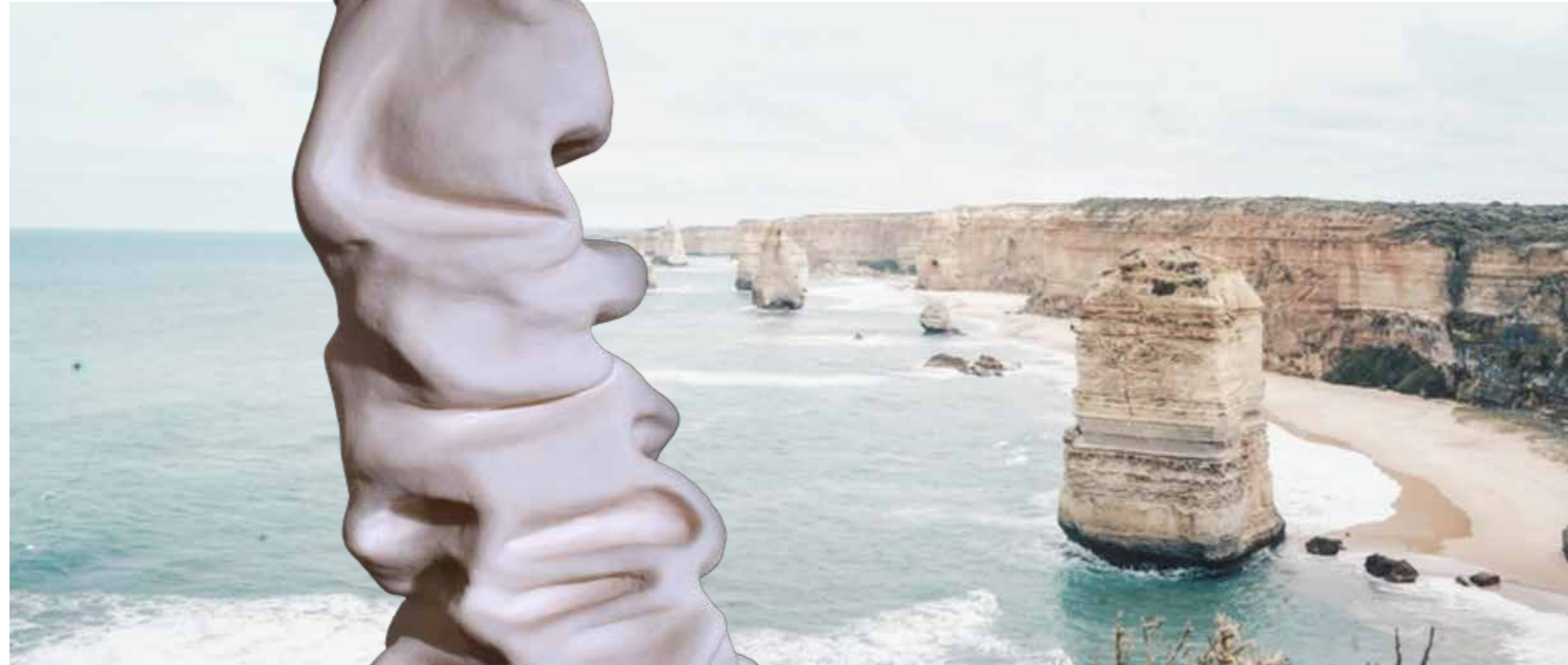
Title: BERMA Technique: Ceramic Size: 24x12x9 cm