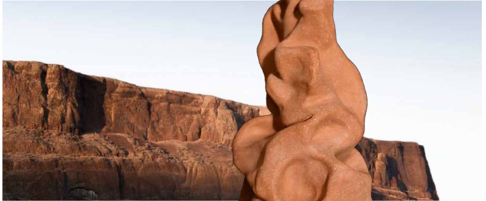
Title: CÁRCAVA Technique: Ceramic Size: 6,5x11x9 cm